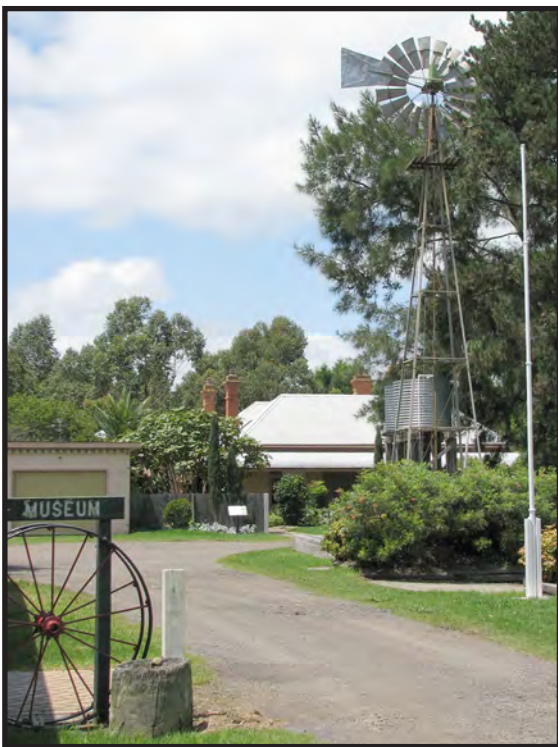
Entrance to Netherby Homestead at Fagan Park

Timber built their slab huts, barns and fences and later, especially during the 1920s, more substantial weatherboard homes.