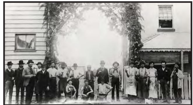
Workmen outside the wheelright's, Windsor St Richmond

A couple of our well-known local lads will tell some tales about the days of rabbit trapping and ferreting. A nice little