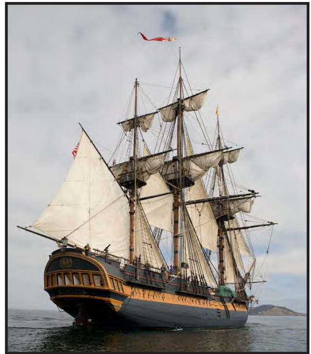
A replica built in 1970 of the Royal Navy frigate Rose later converted to HMS Surprise with considerable attention given to detail and authenticity