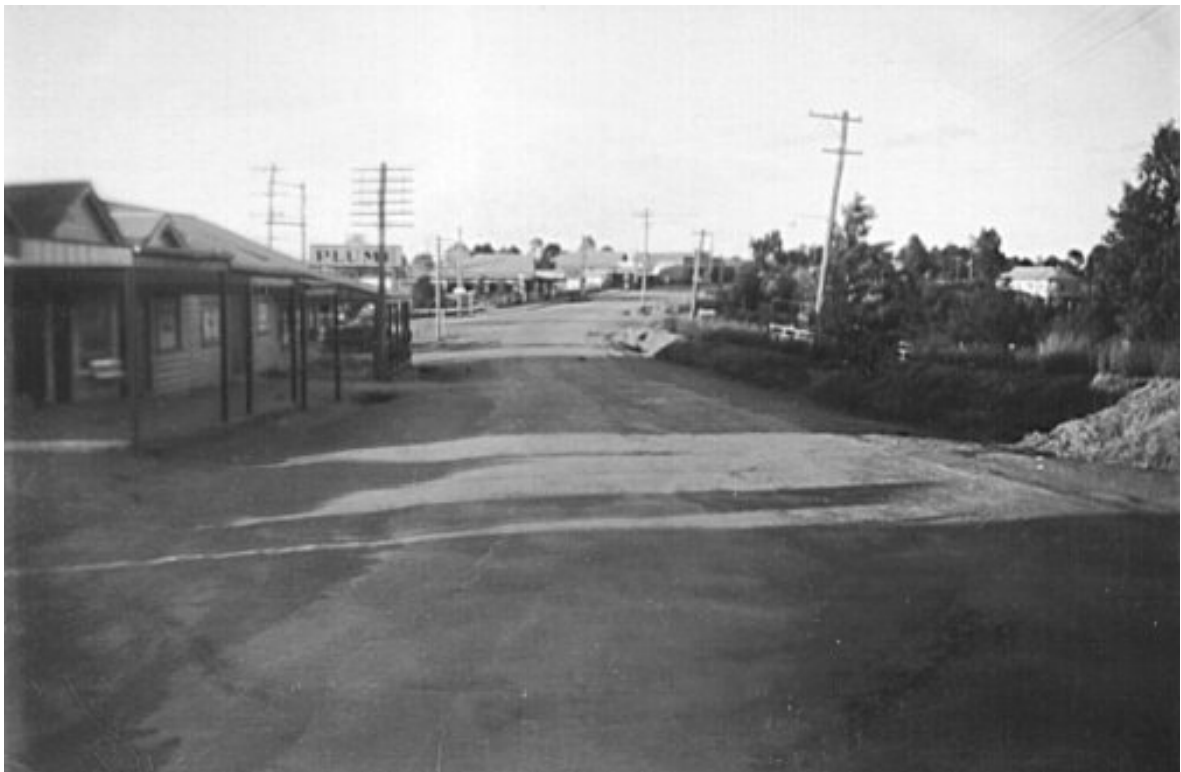
Kurrajong village c. late 1930s.

Bookings: 4567 7921 (Airdrie) or 4573 0836 (Jennifer)