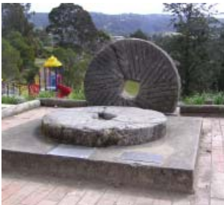
The millstones at Memorial Park, August 2005

A report and design for the new structure for Memorial Park will be displayed at the AGM for comment from members. No further changes will be made to the millstones without input from the Society.