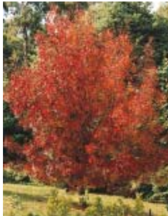
Claret ash: The new street tree for Kurrajong village

At the time of printing Council will have commenced planting these trees in Kurrajong village.