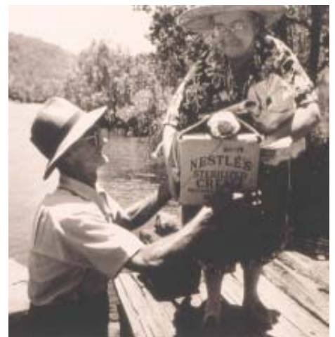
An early delivery on the Hawkesbury River

* 'The Oyster Farmer' (film) 7pm on 24 November (screening in the Tebbutt Room). For more information on any of these events, contact the Hawkesbury Regional Gallery on 4560 4434 or visit the website on www.hawkesbury.nsw.gov.au