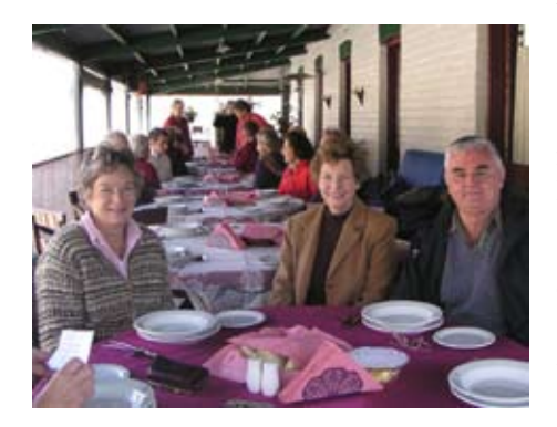
Preparing for lunch at the old Comet Inn on the original Bell's Line of Road, Hartley Vale.

The Comet Inn (1879) is an imposing two storey hotel, with verandahs top and bottom.