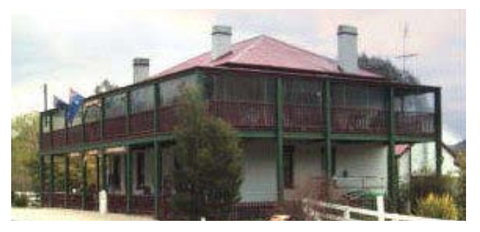
Comet Inn, Hartley Vale.