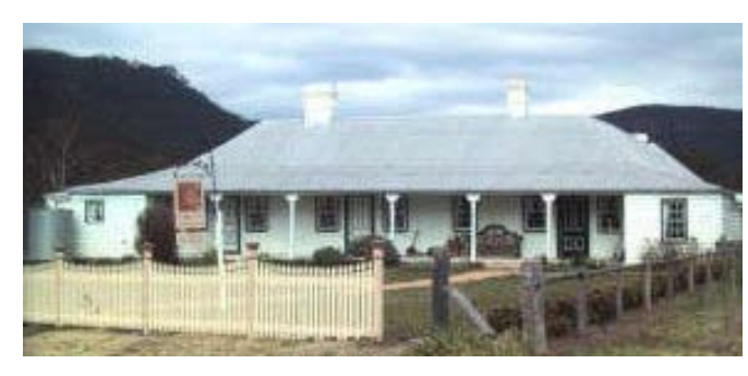
Collit's Inn, Hartley Vale.