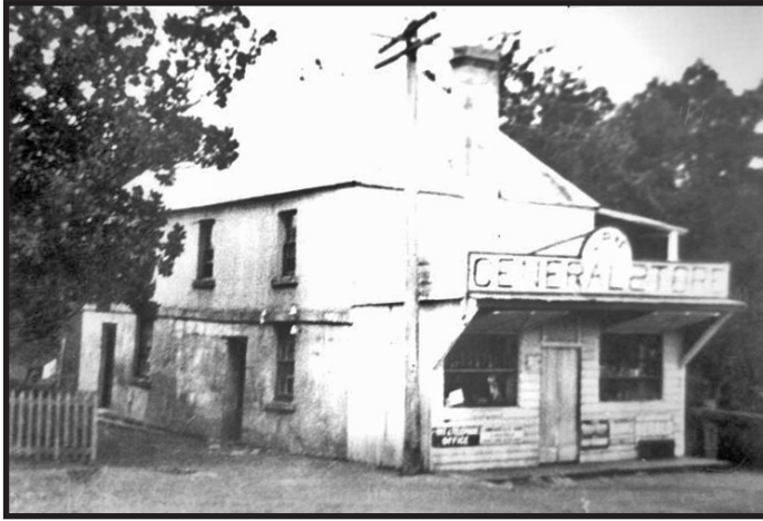
Gold Finders Inn circa 1920's

This was the original Post Office at Kurrajong and later became a general store.