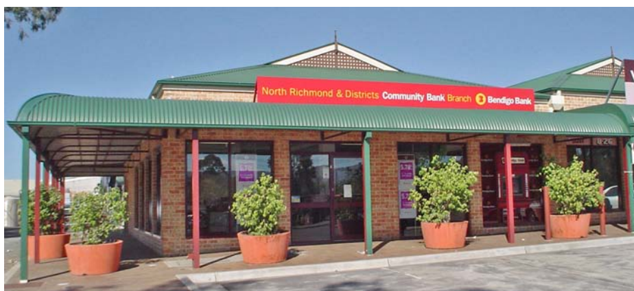
North Richmond & Districts Community Bank Branch Bendigo Bank