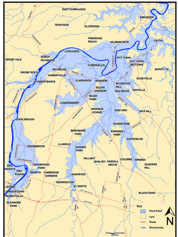
Extent of the floodwaters on the Hawkesbury in 1867