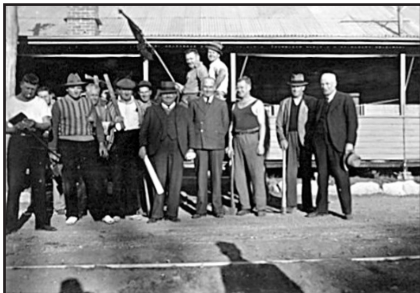
Camp Mackay circa 1940.