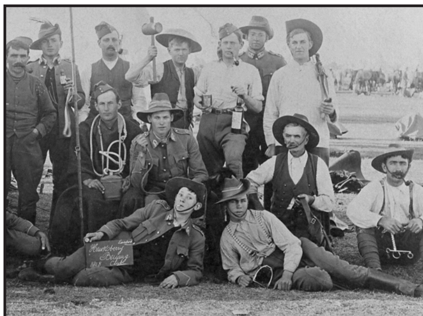
Hawksberry Beaug Club 1908. Further research being undertaken.

Volunteer guides are needed at the beautiful Botanic Gardens of Mount Tomah. Training will be provided to new volunteers. For more information please contact