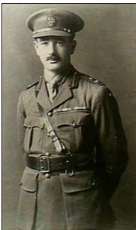
Lieutenant General Leslie Morshead London, England, circa 1942

He was wounded in September 1918, hospitalised and returned to Australia in March 1919. ■