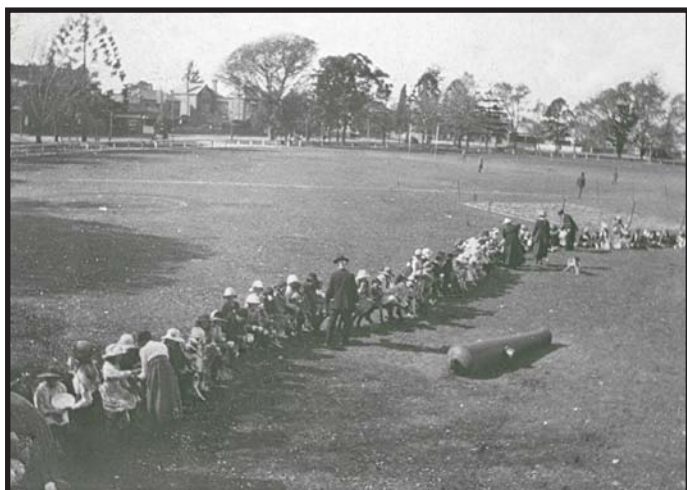
Richmond Park, date unknown