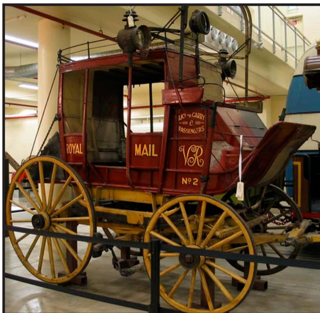
A horse-drawn Cobb & Co. coach used for carrying passengers and mail. It was built by the Cobb & Co. Coach and Buggy Factory Charleville Queensland 1890

One would need many hours to view the thousands of exhibits so many of our members plan future visits to this worthwhile resource centre.