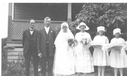
Lord's wedding at Loxley - 1921