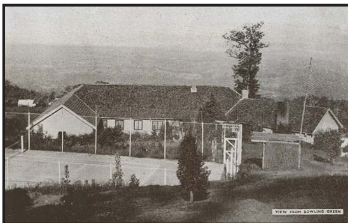
View from the bowling green

Here, one may enjoy unsurpassed scenery, clear invigorating mountain air amid every comfort & luxury. From its spacious verandahs the Hotel commands an extensive panorama, which includes the beautiful orchard districts of Kurrajong, the old historic towns of Windsor, Richmond & the Hawkesbury River & Flats.