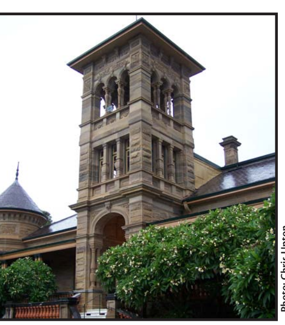
Belmont Park's impressive entrance