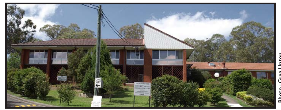
Present-day photo of the nursing home

the end of 2004 the Society was faced with other predicaments. The aged care industry was in financial crisis with many homes being forced to close. Kurrajong and Richmond nursing homes joined forces to alert the community to the gravity of the situation. Discussions with political representatives were of 'no help at all .. there was more support from the public.'