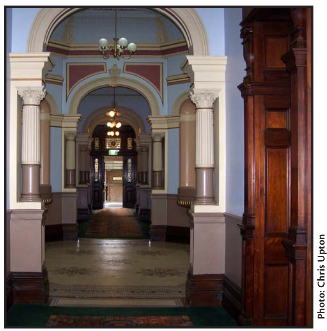
One of the hallways restored by the Brothers from original plans.

Two broad hallways lead off to fifteen large main rooms and twenty-five rooms in total. The main rooms contain wonderful examples of the workmanship of the artisans of that period: beautiful fireplaces, magnificent woodwork and in the library hand-carved bookcases lining one wall. The old dining room has coloured leadlight windows depicting Diana , Goddess of the Hunt, Flora , Goddess of Flowers, Ceres , Goddess of Grain and Hebe , Goddess of Youth. These windows are an indication of Philip's priorities in his life. It is also one of the few private residences built in Australia to have a foundation stone. It was laid in 1892 by Philip's first child, Adeline, when aged two.