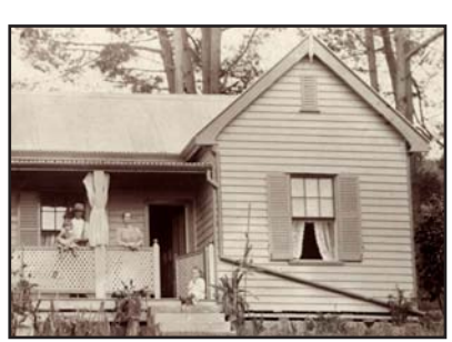
Front verandah circa 1902

Birthdays Weddings Anniversaries Special events Private dining Romantic accommodation