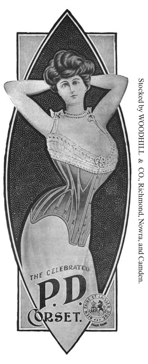
Hawkesbury – Shoalhaven Calendar Directory Guide and Historical Record 1905