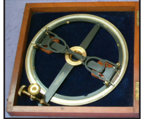
A circumferator from the early 20th century

The 'Gunter Chain', designed in 1620 by mathematician and inventor