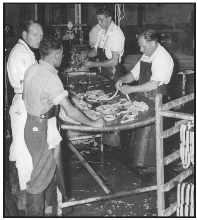
Sausage making in the smallgoods section Circa 1950

diversification. Buildings included beef and mutton production, rabbit and goat processing, a piggery towards Marsden Park, a boning room, the manufacture of smallgoods and pet food rooms, an ice making plant, a fell-mongery and tannery. Other associated plants and products included offal and calves blood, margarine, the 'Imperial' brand of products including the well known 'Camp Pie', a tin shop for can production, an egg plant for the manufacture of powdered eggs, a textile plant whose wool was marketed under the once well known brand 'Villawool' and items made from bone such as buttons and handles for cutlery and toothbrushes. At one time crystallised ginger and cashew nuts were marketed from Riverstone.