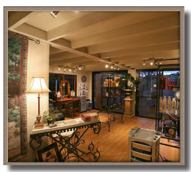
We exclusively use MATRIX hair care products