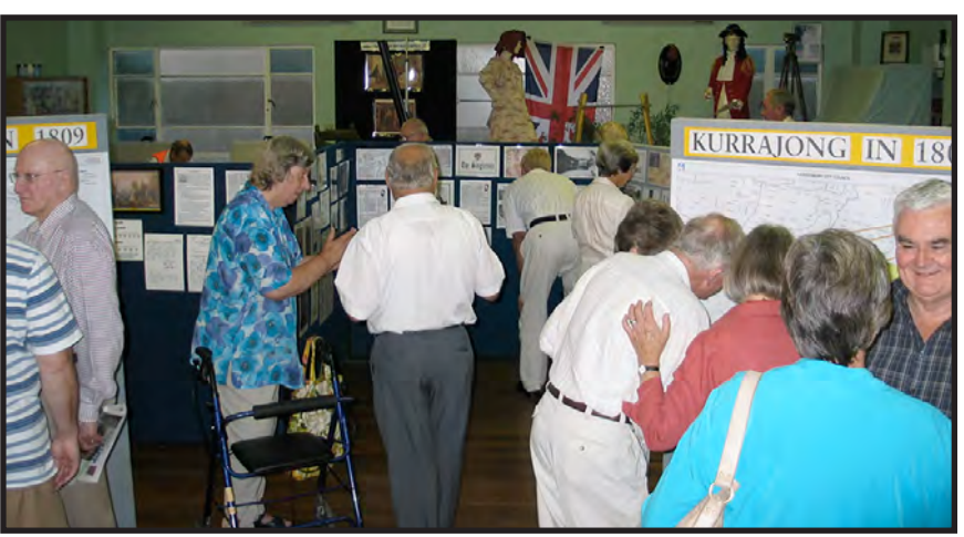
Just a few of the many informative displays being appreciated on the Friday night