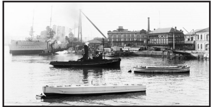
Garden Island 1939

At the left is the RAN cruiser HMAS Australia. Tied alongside is the cruiser HMAS Adelaide. Mid foreground is the steam tug Wattle and a high-speed radio-controlled battle practice target boat