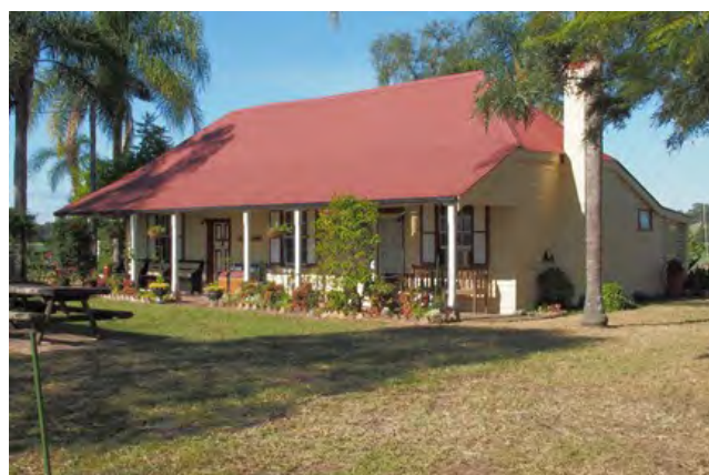
Harmony Farm at Pitt Town Ferry Road Wilberforce