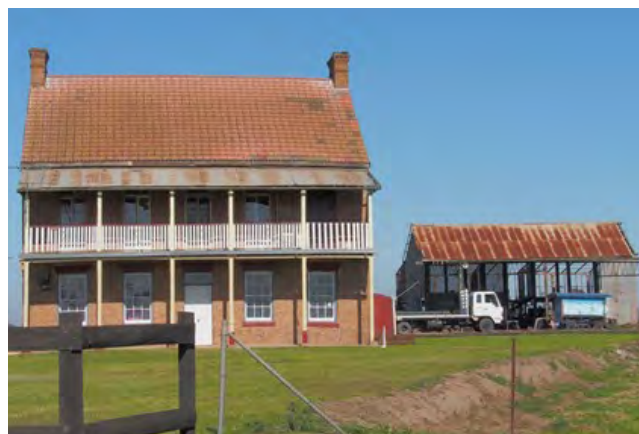
House and Barn 1880s at Freemans Reach on the Hawkesbury River Floodplain