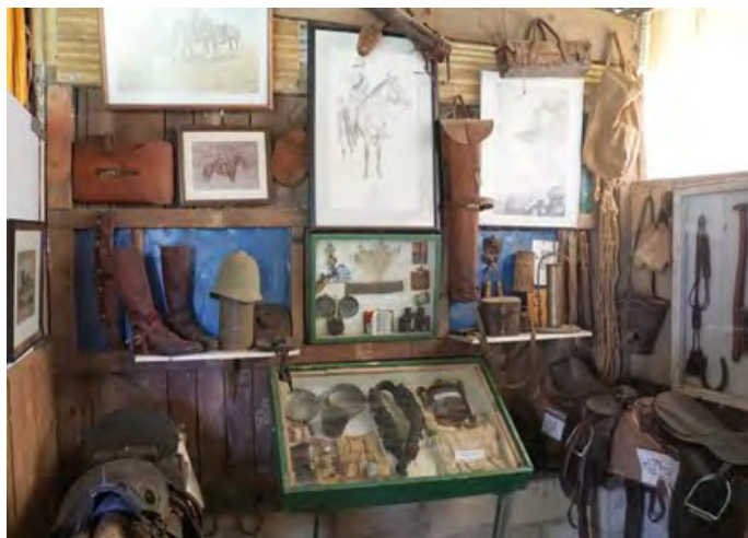
Museum collections - Light Horse Campaigns - Sth African Boer Wars 1880-1881 / 1899-1902 and WW1 1914-1918