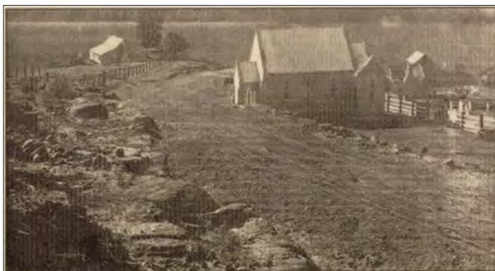
Image: Cavanough's Accommodation House on the left. Colo Anglican Church on right. C1920's

It was Owen Cavanough who donated the four acres of land for the building of the Ebenezer Church. Owen and Margaret are both buried at Sackville Reach cemetery, although some years later their headstones were removed and placed at Ebenezer Church.