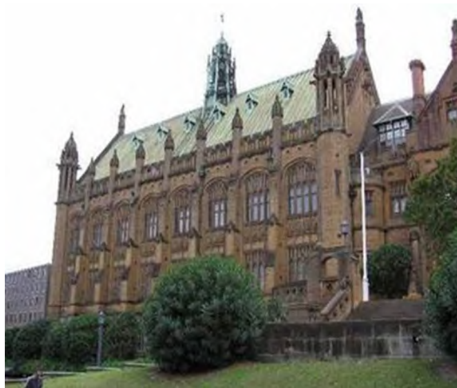
Maclaurin Hall, Federation Gothic Style 1902-1906 once housed The Fisher Library and Reading Room