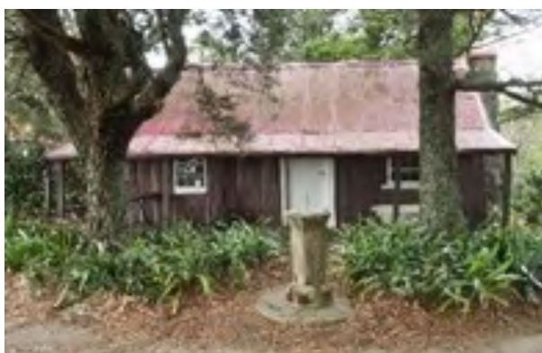
Bunburra Cottage at Fernmount