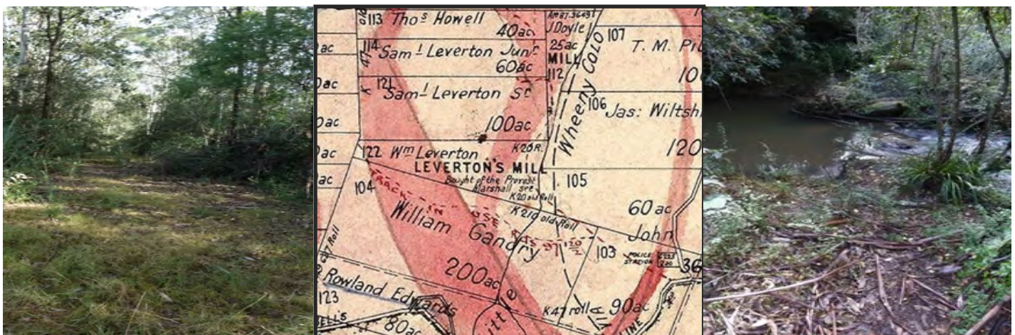
W. Gandry Road in good condition June 2016