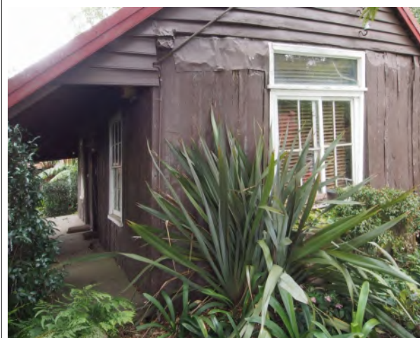
"Bunburra" Cottage