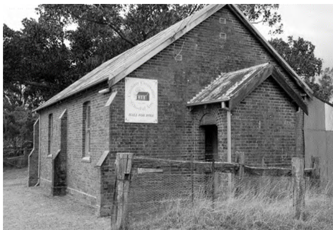
Comleroy Road School of Arts the venue for K-CHS Meetings & Events in the early years of the Society