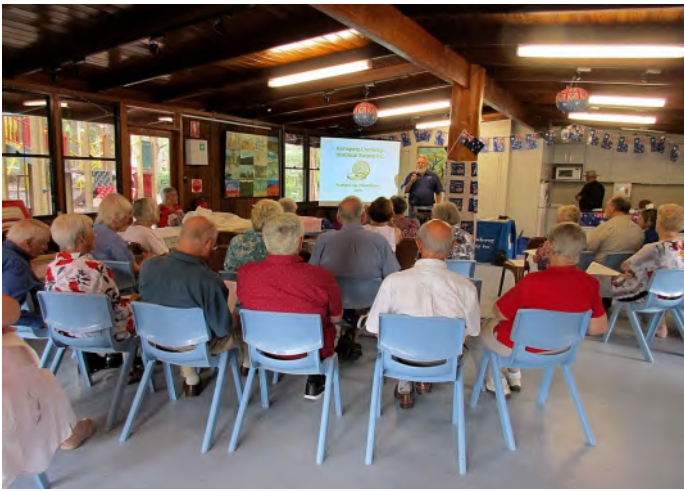
Australia Day 2018 The Hut Bowen Mountain Park