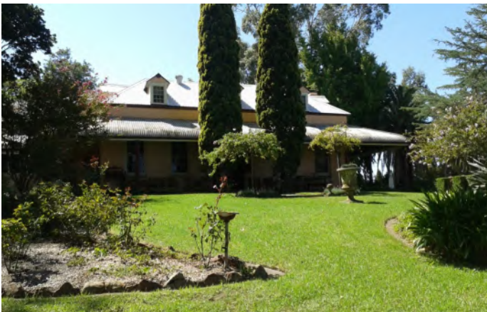
Reibycroft House Freemans Reach Tour March 2018