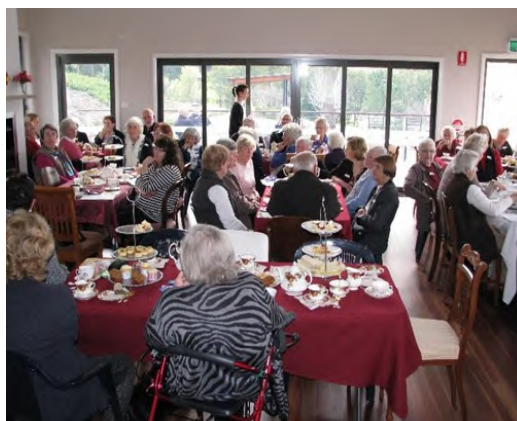
K-CHS FHG hold a successful 2014 High Tea at Tallowood Kurrajong. Members and friends were invited to present their Grandmothers Stories