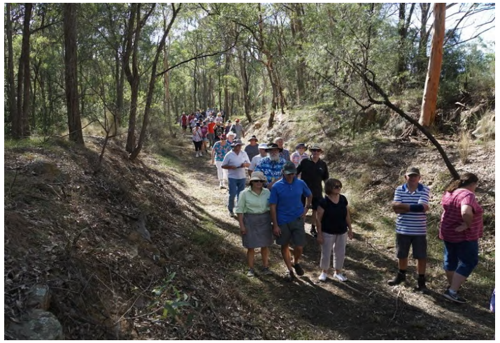
Pansy Line Tour April 2018 in a cutting near Kemsleys Halt