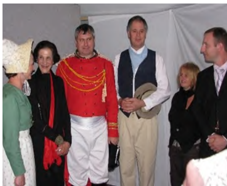
K-CHS Macquarie 2010 events - the Loxley Dinner with guest speaker Marie Bashir included a performance by the Richmond Players. The Local Schools re-enactment, held at Kurrajong School.