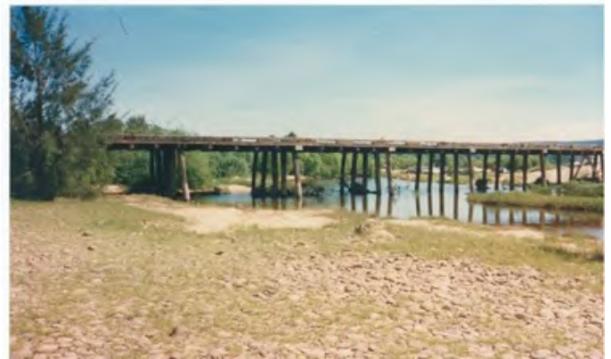
Old Yarramundi Trestle Bridge - Opened 18th April 1925

More recently the large blocks have been subdivided and new homes have been built. The site of the old water mill is now Yarramundi Reserve, but the old river farmlands still grow the crops that feed the city and several of the early homes remain as do some of the larger homesteads.