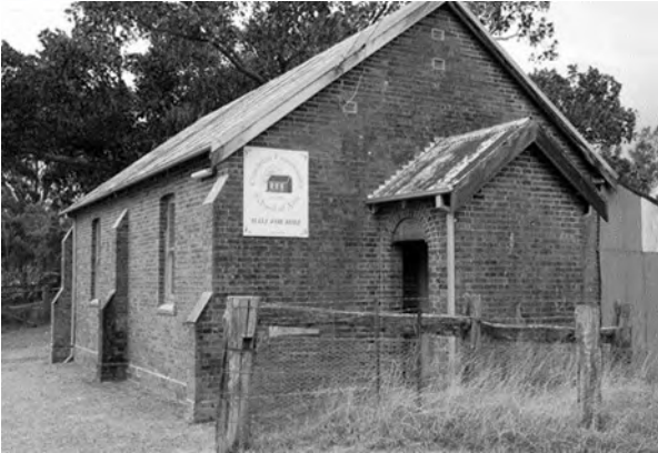
Comleroy Road School of Arts