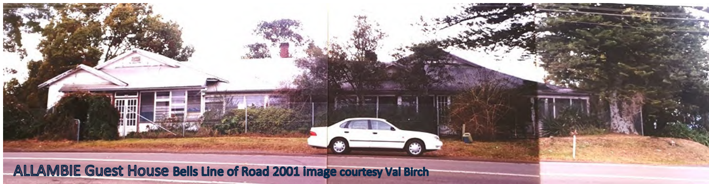
ALLAMBIE Guest House Bells Line of Road 2001