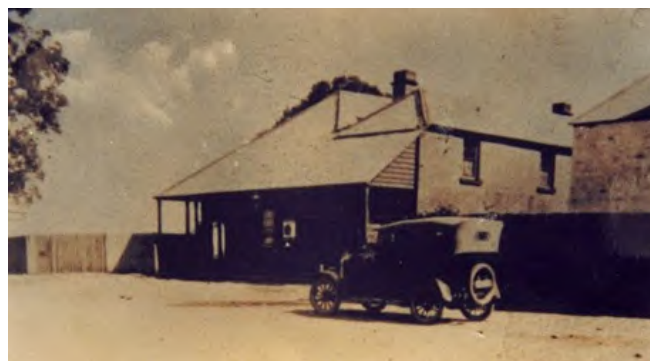
The Traveller's Rest at North Richmond with the ice house on the right c.1920s K-CHS Image 025810

A good time was had by all, exploring features of buildings we might take for granted.