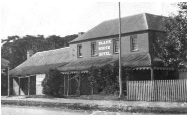
The Black Horse Hotel c.1880s - K-CHS Image 034908

The tour began at the Black Horse Hotel on the corner of Windsor and Bosworth Street, Richmond. It was licenced from 1819 to 1928. It is now hidden behind shop fronts but two proprietors showed us old doorways, stairs and an oven from the 1830s two-storey structure.