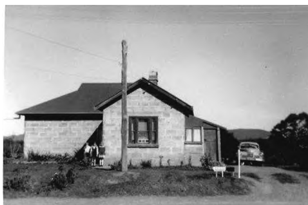
Argyll 305 Bells Line of Road Kurmond 1960s